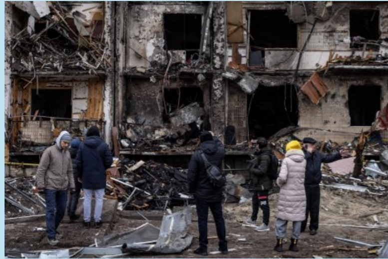
Devastation in Ukraine

politicians, Henry Kissinger had warned against it. In an article for Wall Street Journal in 2014, Kissinger pointed out that “Ukraine cannot act as an outpost for either parties but rather should act as a bridge between the west and Russia...” “Ukraine should not join NATO. . . . Internationally, they should pursue a posture comparable to that of Finland,” carefully avoiding institutional hostility toward Russia.” (Cited in bostonglobe.com March 2 2022)